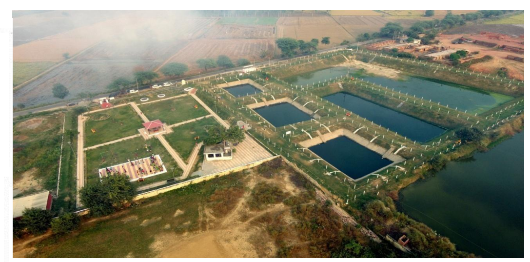
5 Pond System in Village Bhukhapuri, Sub-Tehsil Nigdhu, Tehsil Nilokheri, Karnal