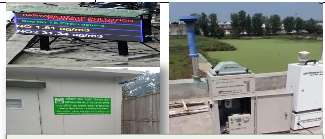
01 CAAQM Station at DC Office, Karnal &