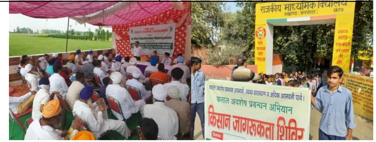
Farmers awareness program on stubble burning