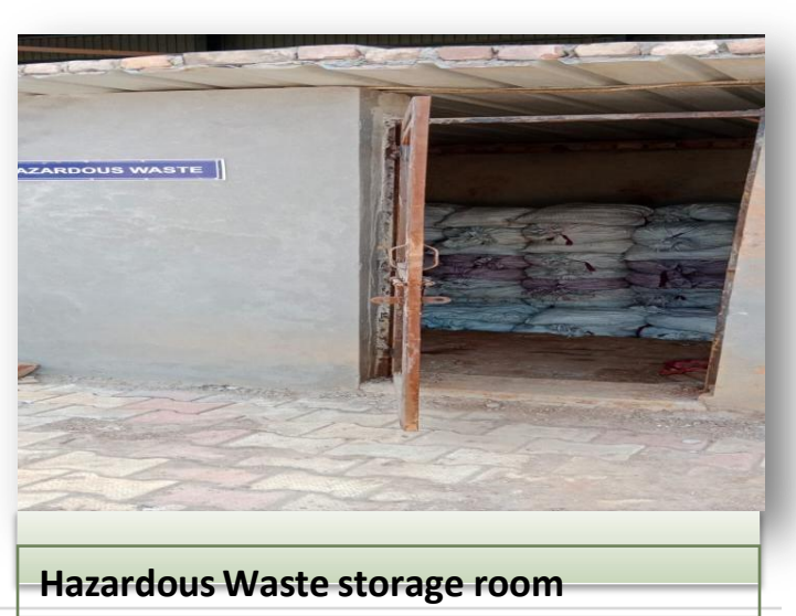
By- Regional Office, Haryana State Pollution Control Board, Karnal